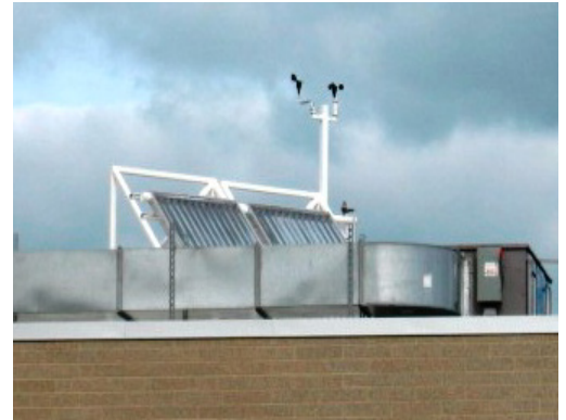
These two solar panels are expected to save 8.5 million BTU’s a year (the equivalent of consuming 217 gallons of gasoline)

Additional “green” features include a reflective roof, eco-friendly furniture, a pre-fabricated exterior wall system that provides superior insulation and energy efficient windows.