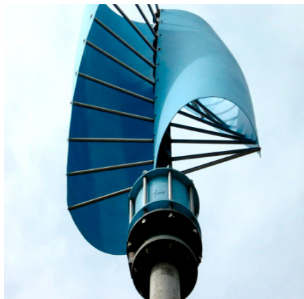
One of the facility’s four wind turbines. The wind farm is a first for a City facility.

The City of Chicago Department of General Services 7th and 10th Ward Yard Building had its grand opening on windy Tuesday afternoon, October 13th, perfect for displaying the capabilities of the four wind turbines that power the facility. The turbines, painted “Chicago Blue”, have the potential to produce 78,000 kilowatt-hours per year. Any excess electricity provided by the turbines will feed right back into ComEd’s grid.